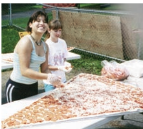
Sidewalk and antiques sales, art vendors and more will be Downtown Phelps till 3:00 PM. Phelps residents can enjoy a free slice of pizza at the Phelps Community Center at 6:00 PM.